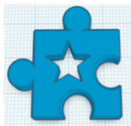
Bok's puzzle piece